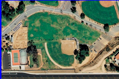
Noble Creek Ball Field #7

$125 per month Up to: Two hours—Twice a week Field is raw, no bases Call (951) 845-9555 to reserve.