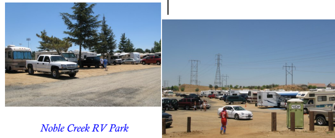
Noble Creek RV Park

East on 10 Fwy exit Oak Valley Parkway— east West on 10 Fwy exit Oak Valley Parkway— east