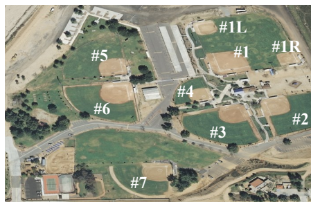
Noble Creek Ball Fields 1—7

All trash in the dug-outs & bleachers are the responsibility of the tournament personnel.