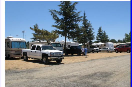
Noble Creek RV Park

Noble Creek Regional Park 650 W. Oak Valley Parkway Beaumont, CA 92223 Tel: 951-845-9555 Fax: 951-845-9557 www.bcvparks.com